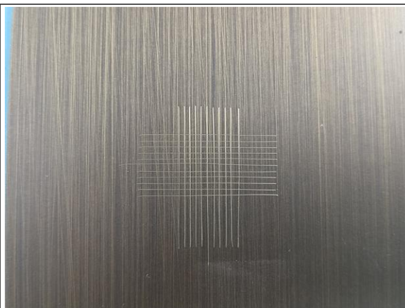
After Test-Sample A-Local Part